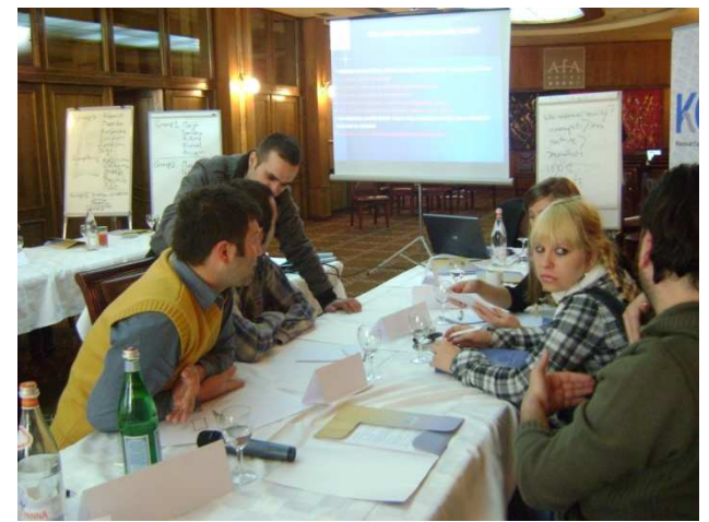
Figure 3. Working groups: local and regional participants during the SSJ 2010