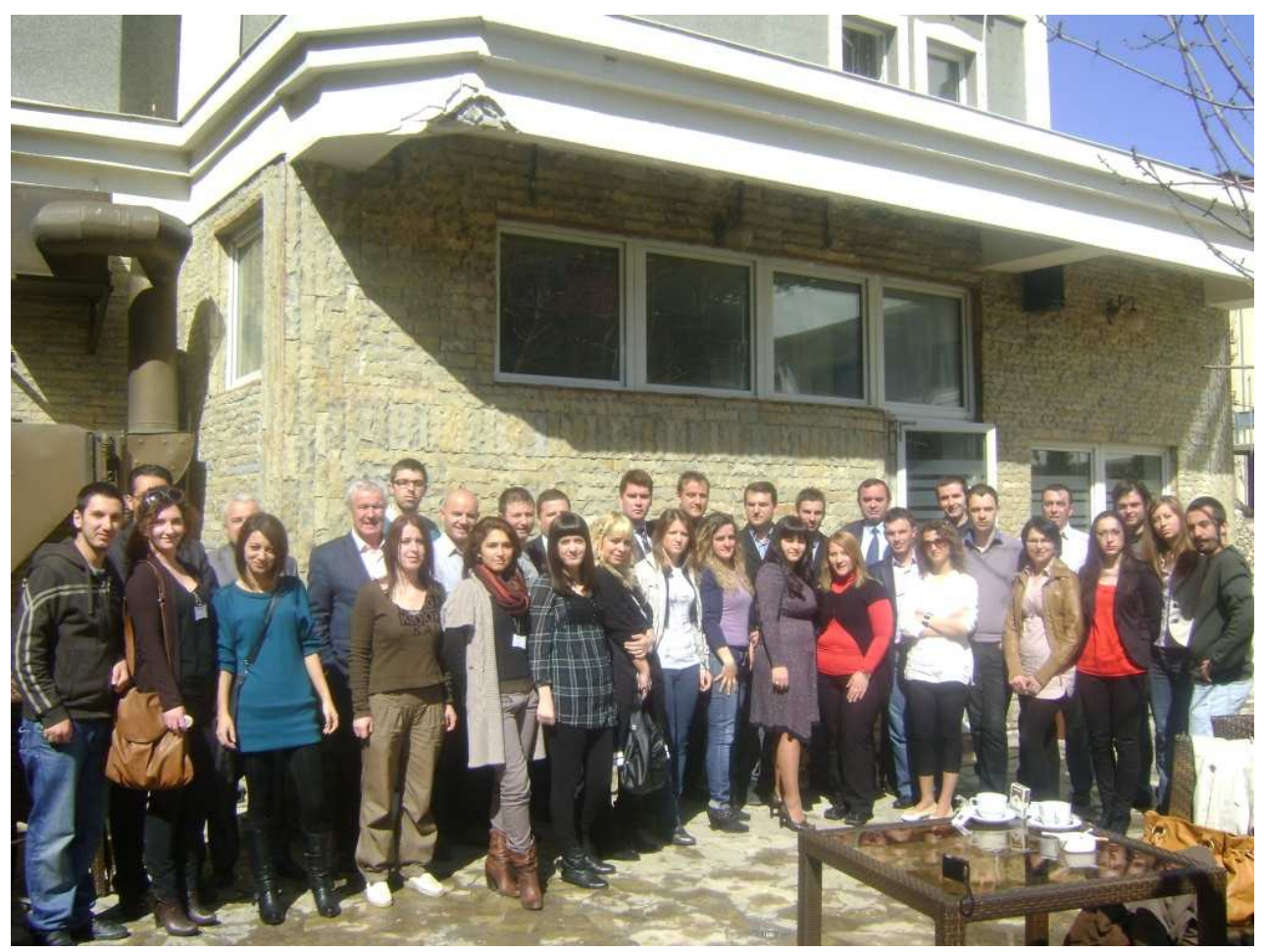
Figure 10 Security Sector School for Journalists 2<sup>nd</sup>